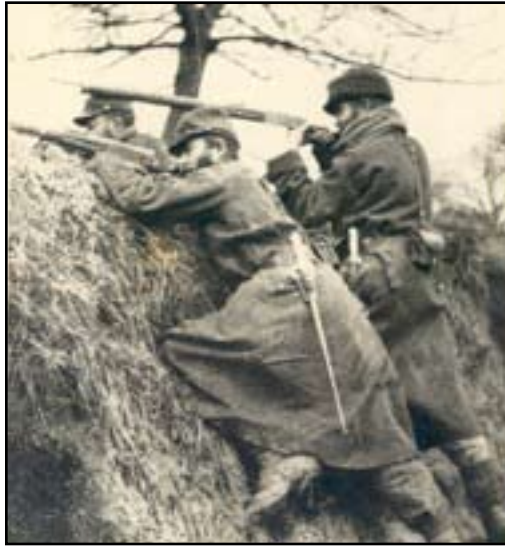
Kiffin Yates Rockwell in WWI Trench a soldier in the French Foreign Legion

Upon recovering Kiffin served with the 1 st Regiment, Moroccan Division and was again wounded. Kiffin, afraid that he'd be discharged, requested a transfer to French aviation service. He was accepted by Service Aeronautique