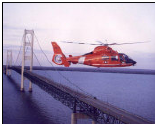
USCG HH-65 over the Macinac Bridge

Their USCG missions include winter and spring domestic ice patrols, Search and Rescue (SAR), Aids to Navigation, and Marine Environmental Response.