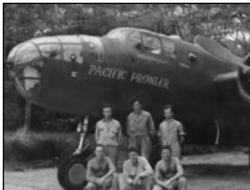
The original Pacific Prowler.

This aircraft has a rich history, a qualified crew, impeccable maintenance, and is in amazing condition.