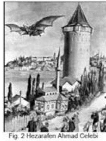
Fig. 2 Hezarafen Ahmad Celebi

A snippet ( http://www.youtube.com/watch?v=Z48P9VQJlhU ) from the movie Istanbul Beneath My Wings shows a cross between a parachute and a wing-suit, but I would not rule out folding hang-glider wings. His brother Hezarafen Ahmed Celebi used a hang-glider three