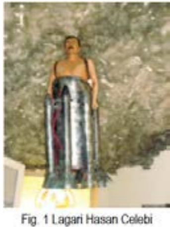
Fig. 1 Lagari Hasan Celebi