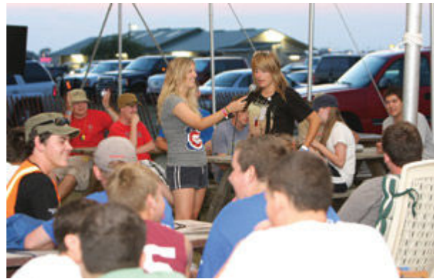
Over 100 kids from Explorer Troops all over the country descended on AirVenture to help along the flightline and learn aviation skills in the various workshops and forums.

"And I want to give them any opportunity I possibly can," Szymik said.